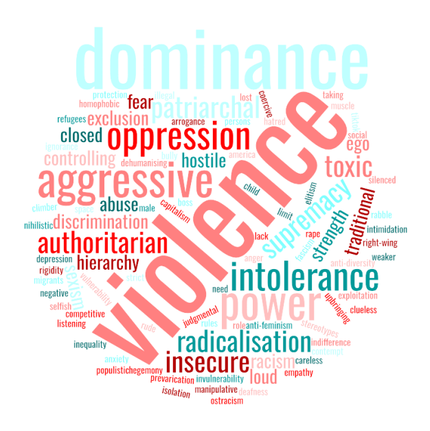
Figure 3. Associative word cloud: nondemocratic/non-inclusive masculinities

The word clouds in Figure 3 and 4 constitute illustrations of project participants' associations before we had even started to interact and co-create: a sort of baseline for our collective work. Standing out in the non-democratic, non-inclusive word cloud is the word violence. Related visible words include dominance, aggressive, oppression, and power. Because participants were prompted to think about anti-democratic masculinities, it is perhaps not surprising to see words such as authoritarian and radicalization as part of the cloud. In the second cloud words associated with openness and care. In a second order we see the words inclusion, diversity and empathy. Again, inclusion is perhaps not surprising as they were asked to associate with democracy, and inclusion is a central principle of most definitions of democracy.