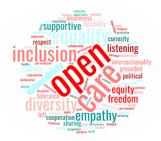
Figure 4. Associative word cloud - democratic/inclusive masculinities

The word clouds map future theoretical work and discussions for MEN4DEM. The next step is to concretize what associations like violence, dominance, aggression, oppression, and power (non-democratic masculinities) as well as inclusion, diversity and empathy (democratic masculinities) imply in practice. This will be an ongoing task in the project, which will involve revisiting literature as well as carrying out the different studies.